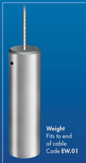
Weight Fits to end of cable Code EW.01

Track mounted minimicro components can be purchased individually - see the minimicro price list for the full range available, or call the technical department on 01923 818282 for full details.